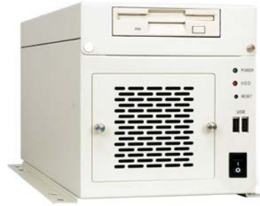
MPC - 1061